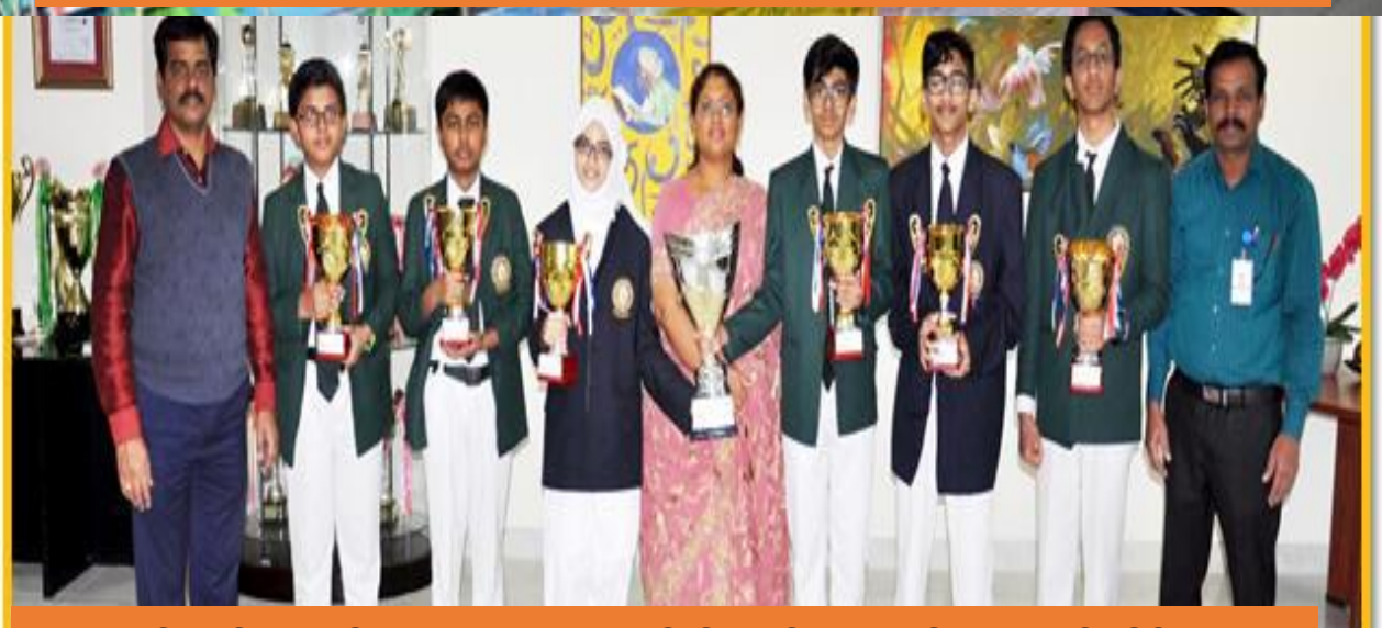
DPS MIS LIFTS THE MATHEMAGIC TROPHY FOR THE SECOND CONSECUTIVE YEAR