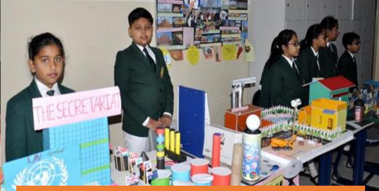
DPS-MIS SRISHTI GARNERED HUGE APPRECIATION FROM THE VISITORS