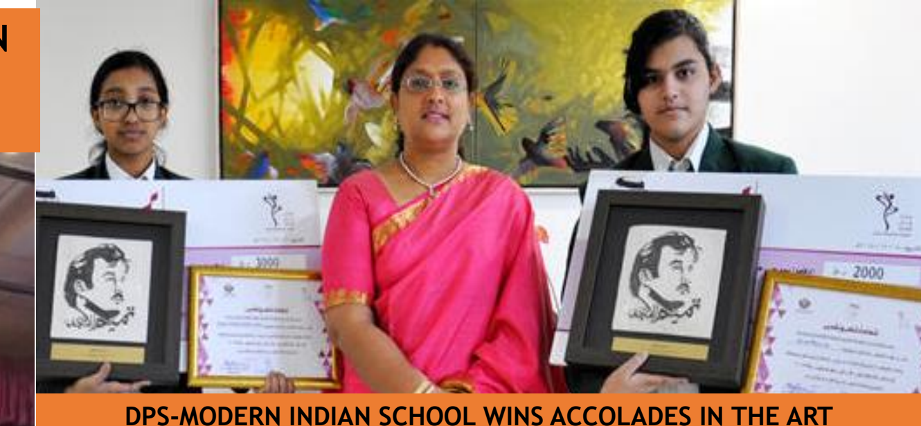
DPS-MODERN INDIAN SCHOOL WINS ACCOLADES IN THE ART COMPETITION

"NIATIONIAL CDEATIVITY DV CMALL LIANIDO"