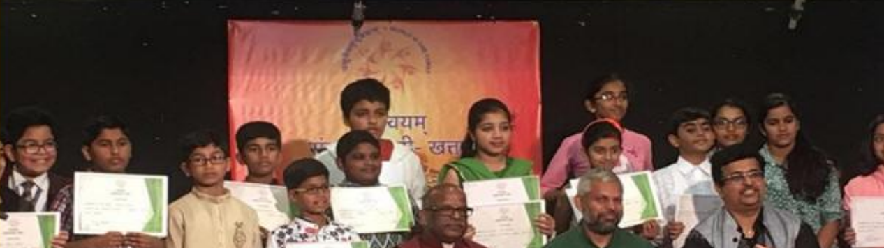
DPS-MIS STUDENTS WON ACCOLADES IN SAMSKRITAM DINAM CELEBRATION