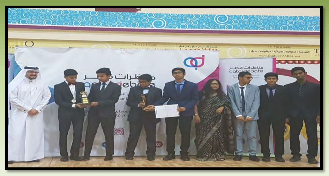
Runner Up Junior Boys