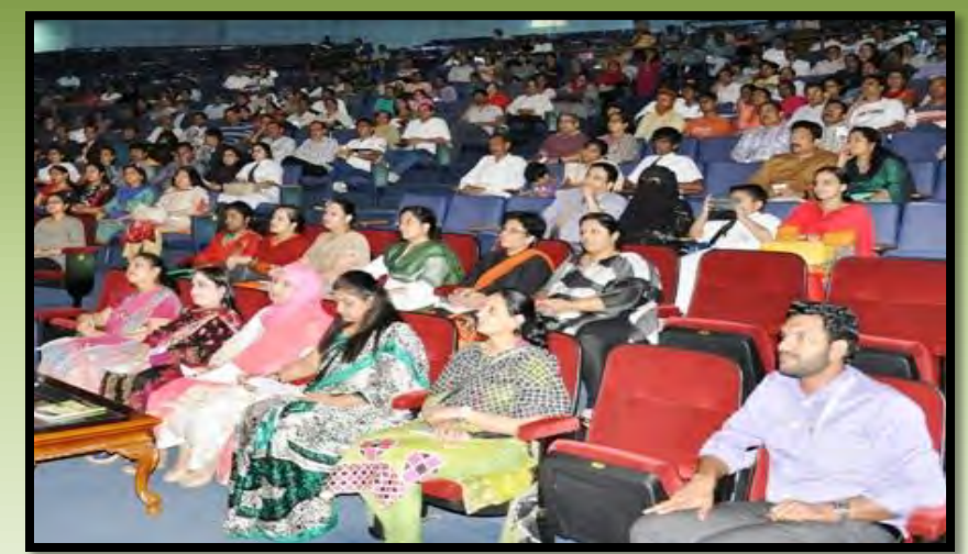
WORKSHOP ON "ACTIVE TEACHING FOR THE PRIMARY SECTION"