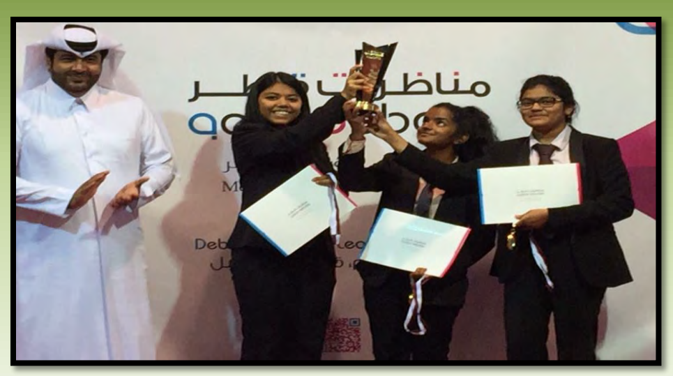
Runner Up Junior Girls